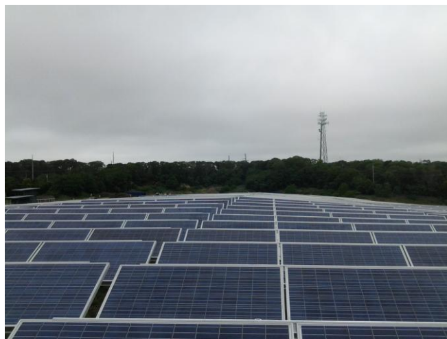
Orleans Capped Landfill Solar PV

Each month Eversource distributes net metering credits in fixed percentages to particular utility accounts assigned by each project participant. CVEC is responsible for ensuring that the credits are distributed to these accounts that are recorded on each project's Eversource Schedule Z. In FY 24, Eversource implemented an on-line portal to maintain the Schedule Zs which CVEC maintains. Each offtaker is responsible to notify CVEC when it wishes to change an account including the account percentage. The offtaker's total percentage is fixed throughout the project term under the project's Inter-governmental Net Metering Power Sales Agreement. These FTM projects include the Eastham Landfill , Barnstable Fire District , Dennis-Yarmouth Regional School District (DYRSD) High School Ground and Roof Mounts , DYRSD Marguerite Small Elementary School Roof Mount and Wixon School Roof Mount , Orleans Capped Landfill , and the West Tisbury Landfill . With the exception of Orleans which has no offtakers, projects have as many as nine offtakers. The same Revenue-Sharing method as noted above is applied to these projects. Note: CVEC is the Eversource Host for the Eastham, Orleans and West Tisbury Solar projects.