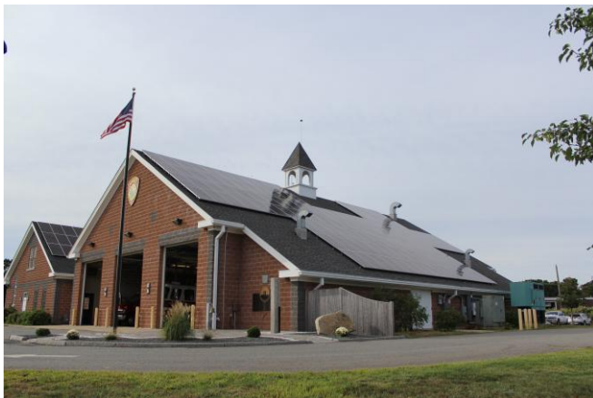
Yarmouth Fire Station 3

The majority of CVEC's projects are BTM solar roof-mount projects without batteries in which CVEC buys the energy from a developer and resells it to the host. Two BTM projects have batteries. The developer builds and owns the project located on the host's property. The developer calculates the monthly energy production and invoices CVEC for the energy production at a 20-year fixed price determined through the initial RFP process. CVEC then invoices the Host for the monthly cost of energy plus an administrative adder per kWh for project management. However, CVEC does not charge an administrative adder for CVEC-7 BTM Projects.