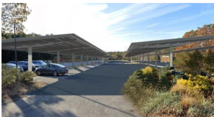
Brewster Captains Golf Course

Certain projects have a lease agreement between a Host and the developer instead of a PPA between CVEC and the developer. The Host receives a monthly lease payment over the life of the solar PV system. This lease-only agreement falls outside of CVEC's regular procurement model which CVEC no longer uses.